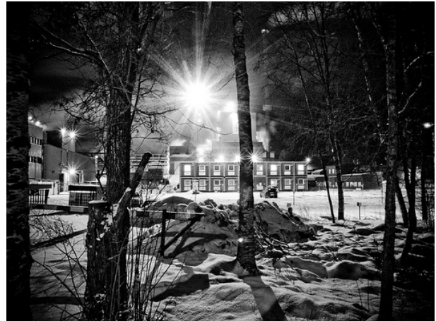
SCA Obbola at night

Here are some pictures of the interface cabinet 'before and after'.