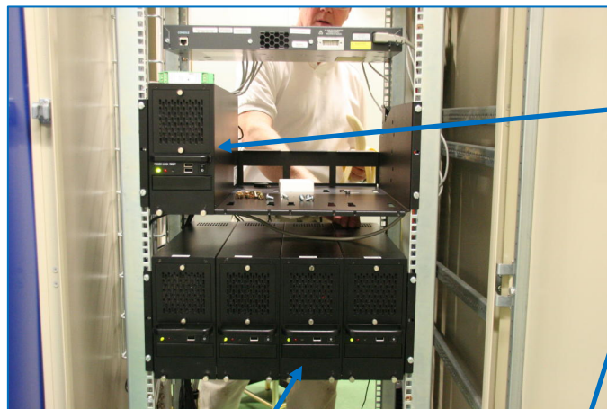
New mMaster computer