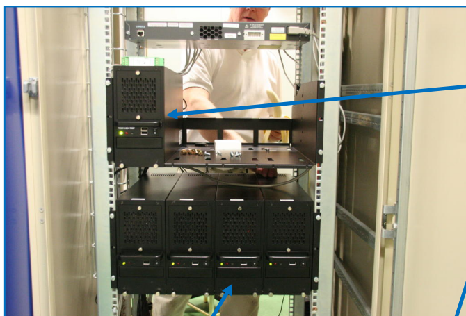
New mMaster computer