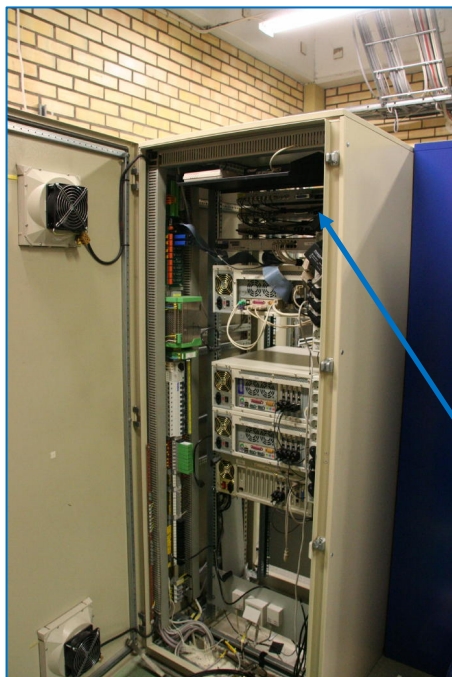
Cabinet before we started