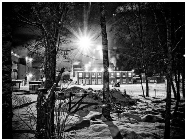
SCA Obbola at night

Here are some pictures of the interface cabinet 'before and after'.