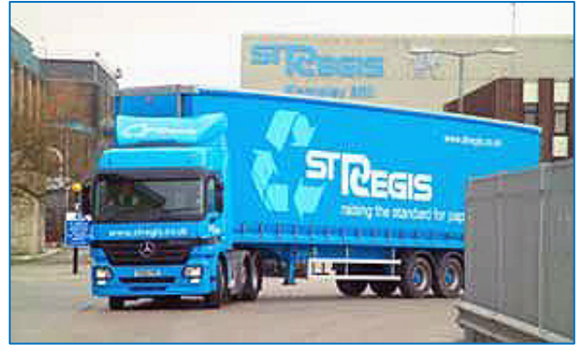
St Regis Kemsley Mill

Millsight had already supplied many replacement pinhole cameras and lights for the ABB/MTC and Honeywell Hilcont camera systems installed on the other paper machines at the Kemsley site, as well as Millsight systems and replacement cameras/lights at other St.Regis UK mills.