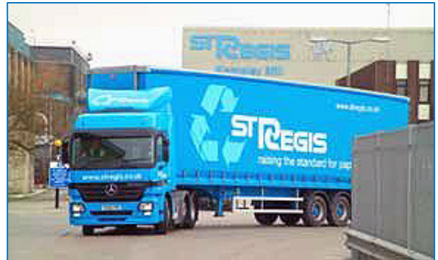
St Regis Kemsley Mill

Millsight had already supplied many replacement pinhole cameras and lights for the ABB/MTC and Honeywell Hilcont camera systems installed on the other paper machines at the Kemsley site, as well as Millsight systems and replacement cameras/lights at other St.Regis UK mills.